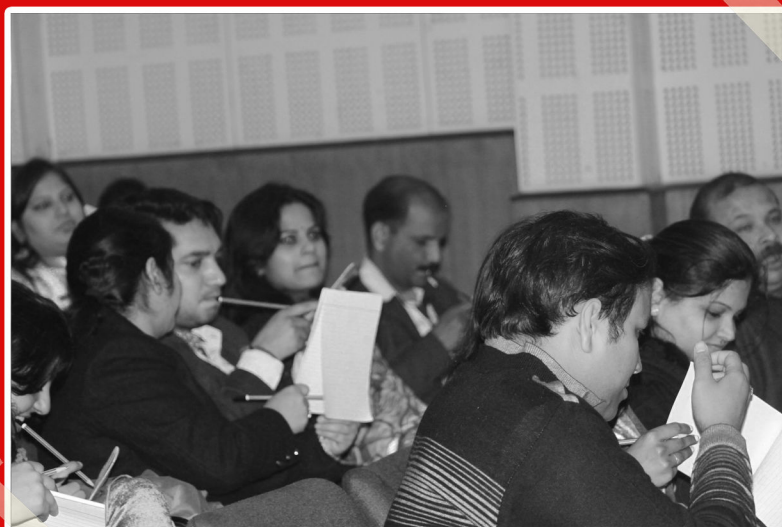
UNDERSTANDING HABITS OF MIND