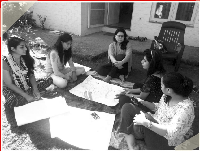
OUTSTATION TRAINING FOR SCHOOL HEADS