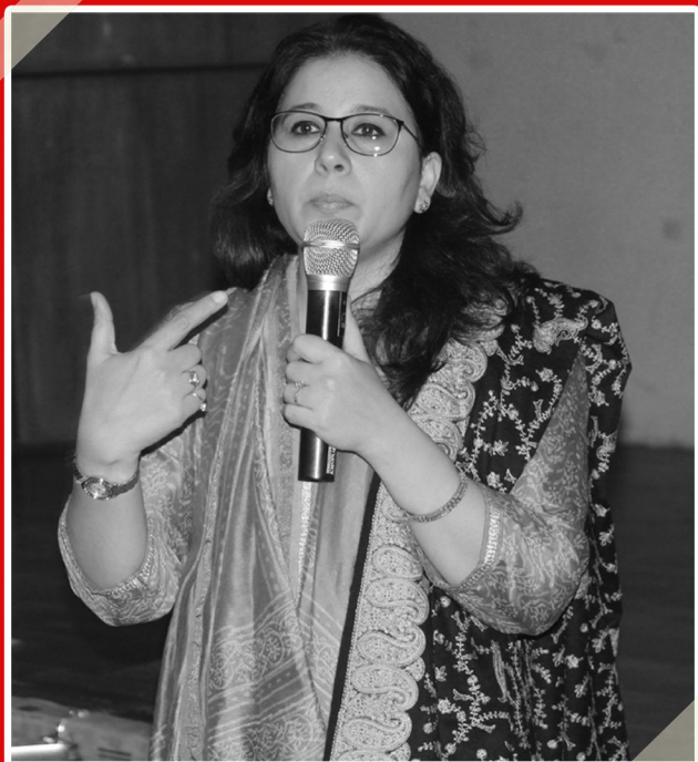
BE THE CHANGE YOU WANT TO SEE