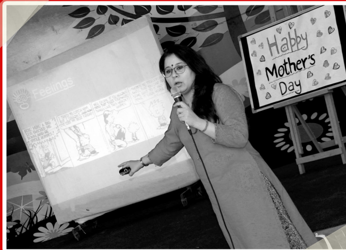
A SESSION ON MOTHER'S DAY